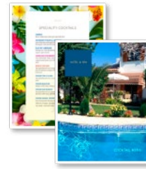
Synthetic Paper 4 (Water-resistant & Durable)