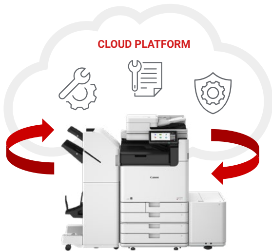
Devices shown with optional accessories.

By combining powerful embedded platforms with industry-specific applications, imageFORCE enables organizations to reimagine their workflows and ensure their imaging technology evolves with their business needs.