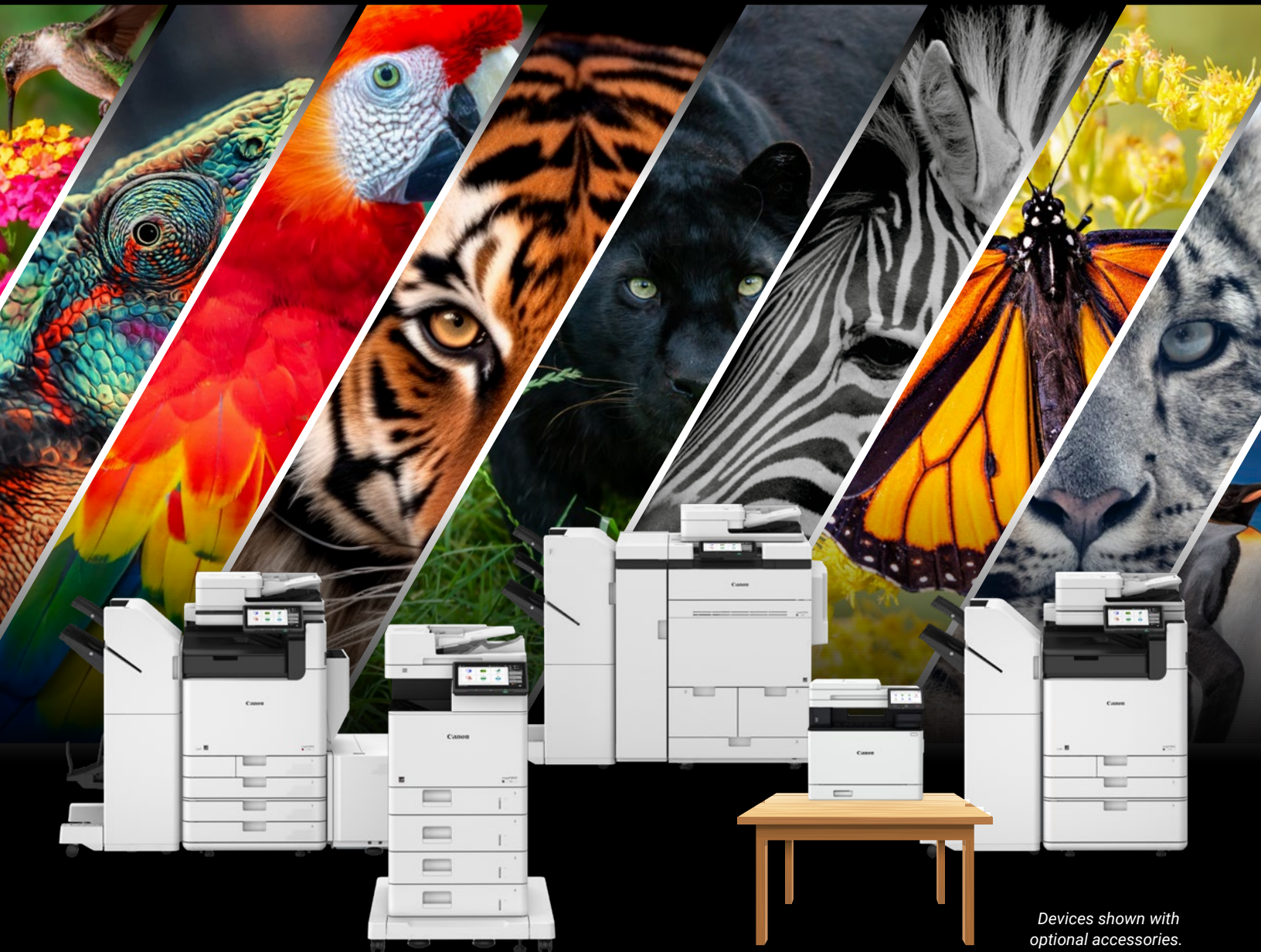
Devices shown with optional accessories.

The Power of Next represents Canon's latest phase of ambitious and advanced print innovation with the comprehensive line-up of imageFORCE technology. This highly productive lineup is designed to help you print better, do more, and stay ahead in today's digital workplace.